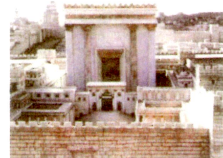
Book 5 of the Psalter: Psalm 127 "Unless the LORD builds the house"